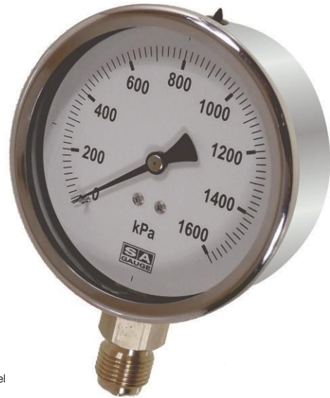
Type R Roll Ring Bezel

For dimensional drawing see technical section